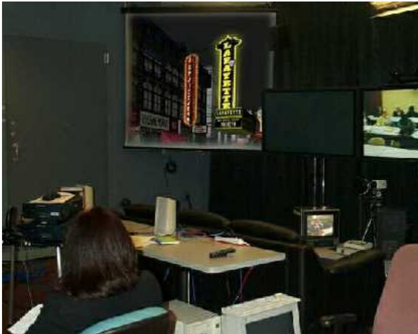
Figure 1. Virtual Harlem running on the AGAVE system in the classroom at UIC next to a remote view of Carter's classroom at CMSU.

During the Virtual Harlem session, UIC students (using either CAVE or AGAVE) navigated around the virtual space with the joystick for about 5 to 10 minutes; there was no particular time limit imposed. Typically 3 to 7 students walked around the Harlem space in a group. Meanwhile, CMSU students watched a 10-minute long video movie that contained the Virtual Harlem walk-through with Carter's narration. After exploring the space actively in the CAVE/AGAVE at UIC or passively through video at CMSU, the students wrote evaluations of what they observed in the Virtual Harlem experience and what they thought would be interesting to see in the future. They also compared this experience in Virtual Harlem to what they read about Harlem.