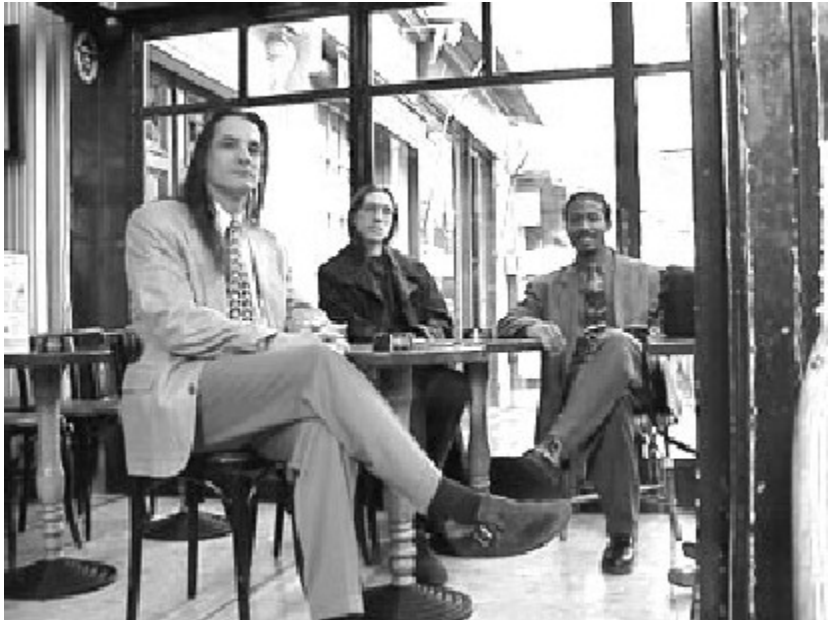
At the Sorbonne