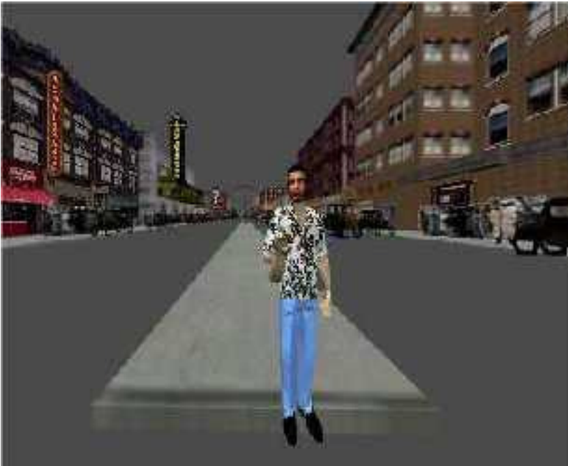
Figure 2. An annotation in Virtual Harlem appears in the form of an avatar (a representation of the person leaving the annotation) which can look or point at locations while talking.

and do fine-grain highlighting to aid memory. Annotations help them understand a text and to make the text more useful in future tasks. We can similarly use annotations within the virtual environment for a variety of tasks. Enhancements to Virtual Harlem include an annotation tool that allows students or instructors to leave annotations throughout the virtual space that can be retrieved by themselves or others in future visits. Virtual annotations are recordings in virtual reality where both the person's hand and head gestures, as well as their voice, are captured. Since the CAVE is automatically capturing the position and orientation of the user's head and hand, the only additional burden on the user is the microphone which records their speech. Since Virtual Harlem is a three-dimensional space, the head and hand gestures allow the user to point toward landmarks in the space and give more nuances to their speech. When the annotations are played back, an avatar appears to re-enact the annotation (Figure 2). Students were encouraged to form their own opinions on the things they saw and heard in the Harlem experience and then to leave annotations that other students could further comment on with their own annotations, creating a 'feed-back' loop. Through this process, we anticipated that students and instructors would spur discussion and